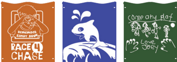
Custom panel examples

Once all designs have been collected, have students or faculty vote on their favorite design from the grade level categories (for a total of three different custom panels for your play structure).